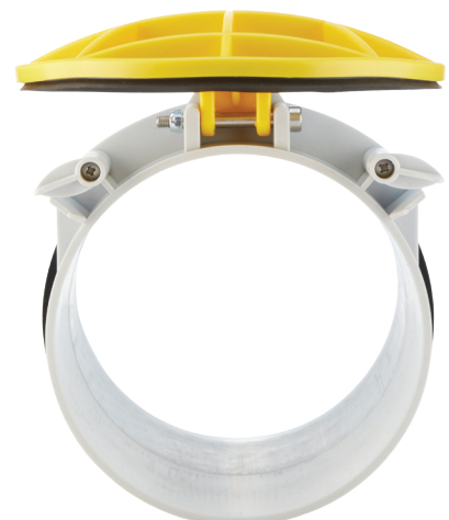
NRV150 for DN150 pipe inlets