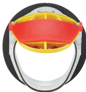
NRV100 for DN100 pipe inlets